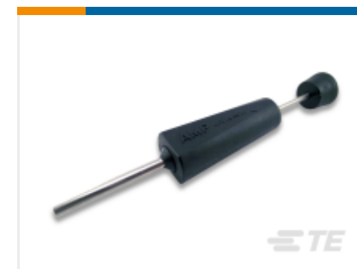
TE Part # 305183 EXTRACT TOOL TYPE 2 20-16