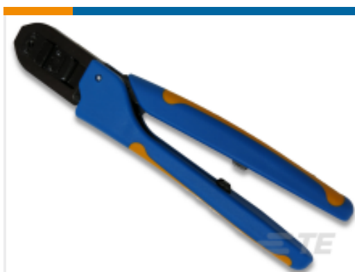
TE Part # 91519-1 CCII TYPE III+ PIN SKT 18-14 ASSY